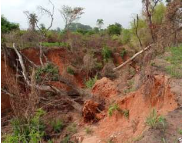
Figure 2. A photograph of the gully site