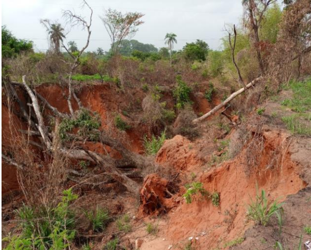
Figure 2. A photograph of the gully site