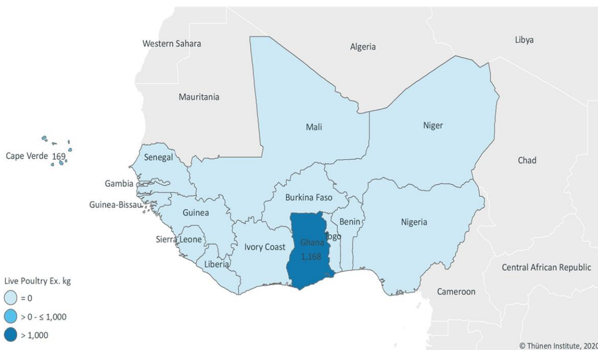
Figure 2. The Volume of Live Poultry Exports from Germany to West African Countries in 2017 (in kg) Source: Data are based on UN Comtrade (2017). HS code of live poultry: 0105. Map created with ESRI (2020) NOTE: Data are based on Germany as the reporting country