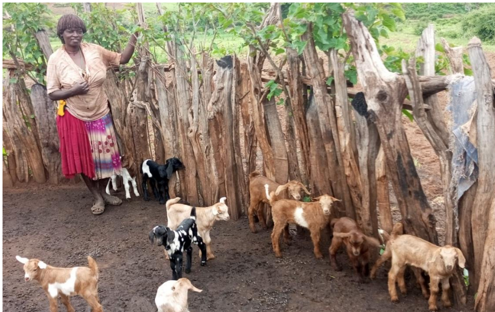
Figure 1. The 25% Boer x-Woyto-Guji crossbred goats

Damascus Goats performed better in Egypt. The nearest result was also reported by Abd-Allah et al. (2016) for Boer x- Baladi crossbred kids in Egypt at birth and weaning age groups. According to Deribe et al. (2015), birth weight and weaning weight of Boer crossbreds were significantly higher than the weight of indigenous breeds and the difference diminished as the age of the kids advanced. The aforementioned may be due to the management conditions and may not allow animals to express their genetic potential. The shortage of forage, lack of concentrate feed, diseases and low veterinary care are associated with a high mortality rate of kids and also contributed to their share (Kosgey et al., 2006; Manirakiza et al., 2020).