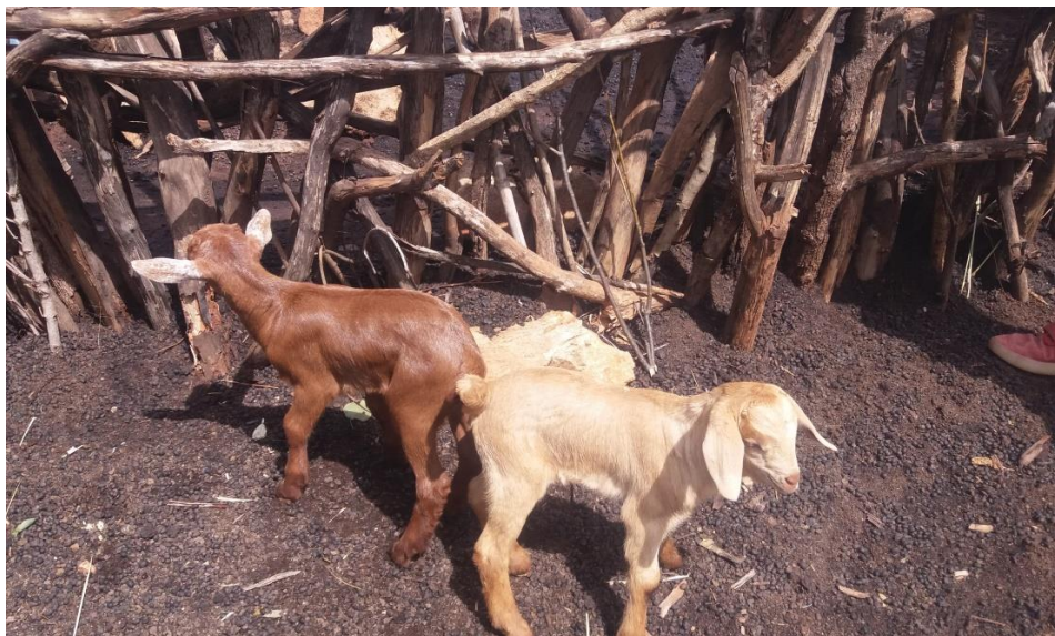
Figure 2. The 37.5% Boer x-Woyto-Guji crossbred goats

The current findings on average BWT (2.79), WWT (8.6), SMWT (13.47), and YWT (16.84) of 25% Boer crossbred goats were lower than the report of Tamirat et al. (2022) who stated BWT (3.10kg), WWT (9.77kg) and YWT (19.57kg) of 25% Boer-Borana crossbred goats. But similar