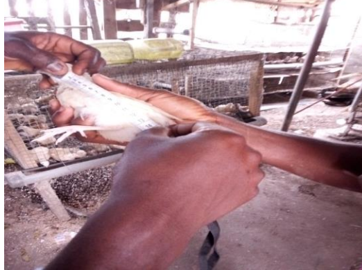
Figure 3. Measurement of body length using measuring tape

Body Length (BL): the length was taken from the nasal opening, along its gently stretched neck and back, to the tip of its pygostyle.