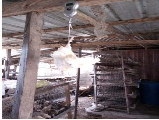
Figure 2. Measurement of body weight using a hanging spring balance

Body Weight (BW) (g): Live weight of quails recorded using a digital hanging spring balance