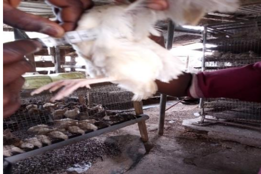
Figure 5. Measurement of body girth using measuring tape

Body Girth (BG) was taken as measuring tape was looped around the region of the breast under the wings.