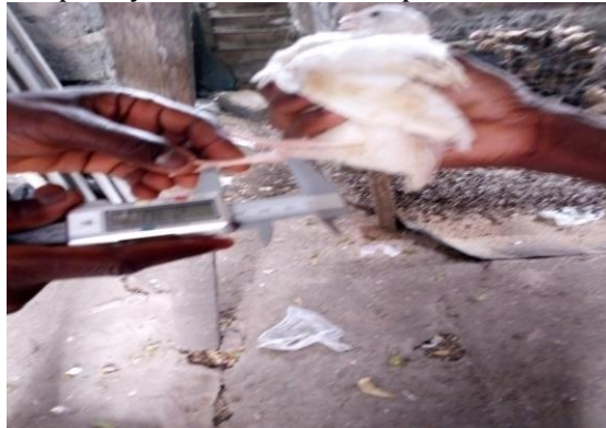
Figure 4. Measurement of shank length using a vernier caliper

Shank Length (SL): length of the shank from the hock joint to the spur of either leg or footpad by a set of Vernier calipers.