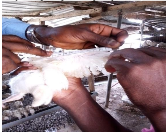
Figure 6. Measurement of wing length using measuring tape

Wing Length (WL) was the distance from the humerus coracoid junction to the distal tip of the phalanges digits, using a tape measure.